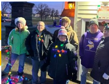
Ringin of Bells and Fall Dance