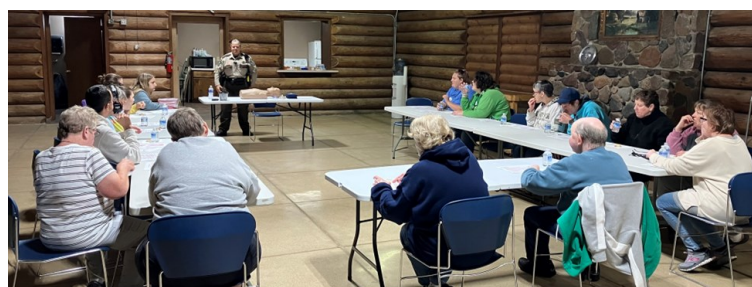
Ceramic and Emergency response class.

WHERE: CONFERENCE ROOM ACROSS FROM THE AIM OFFICE