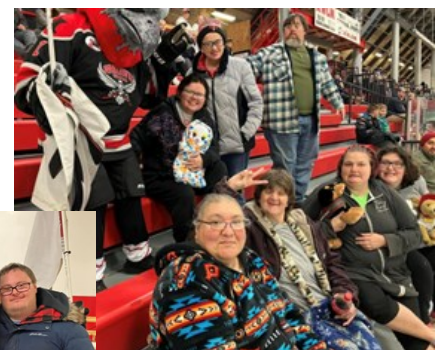
VIP Warhawks game